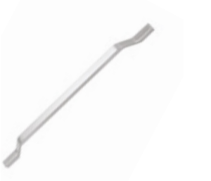
Soho Strap 320mm Brushed Nickel / Code 108 New