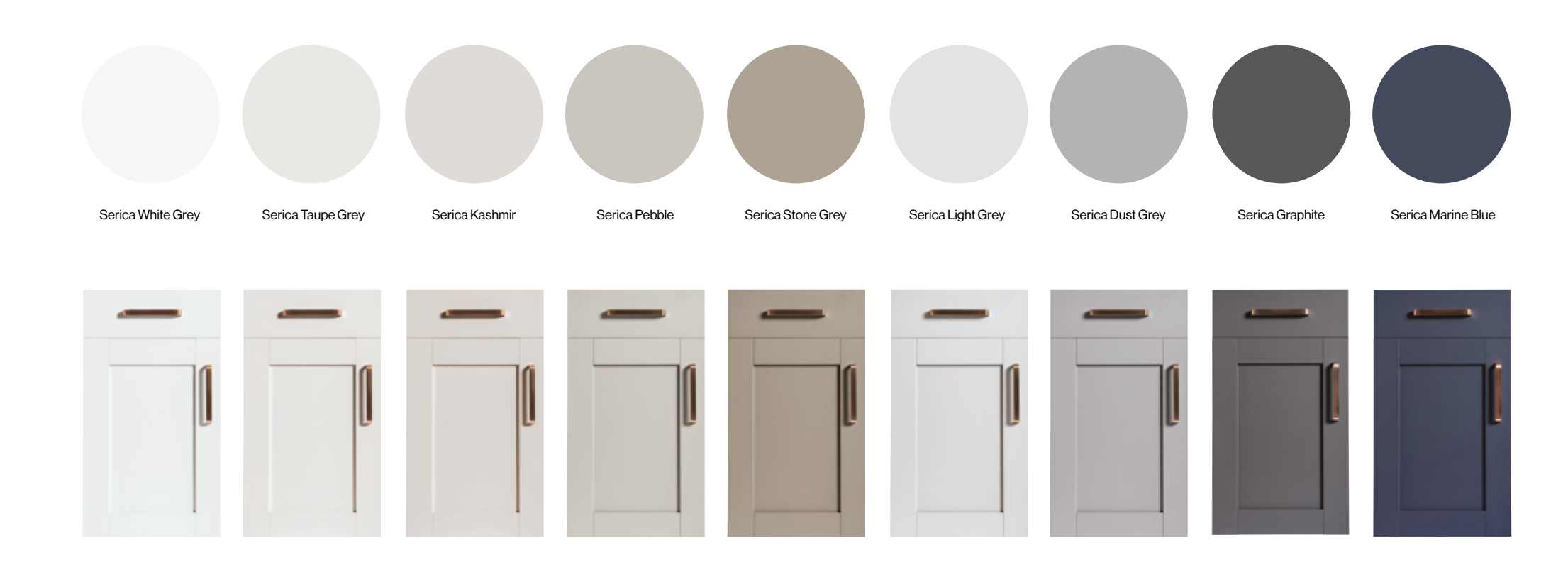
Loxley Choose from timeless, on-trend colours.

Please note the colours used throughout this brochure are approximate. See Swatch Book for true colour match.